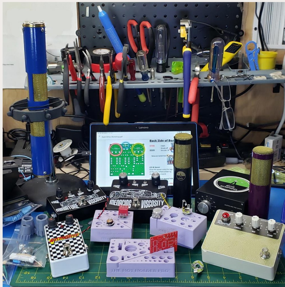
Collection of Austin mics, pedals, kits, and tools.

diyribbonmic@gmail.com or visit www.AustinMics.com .